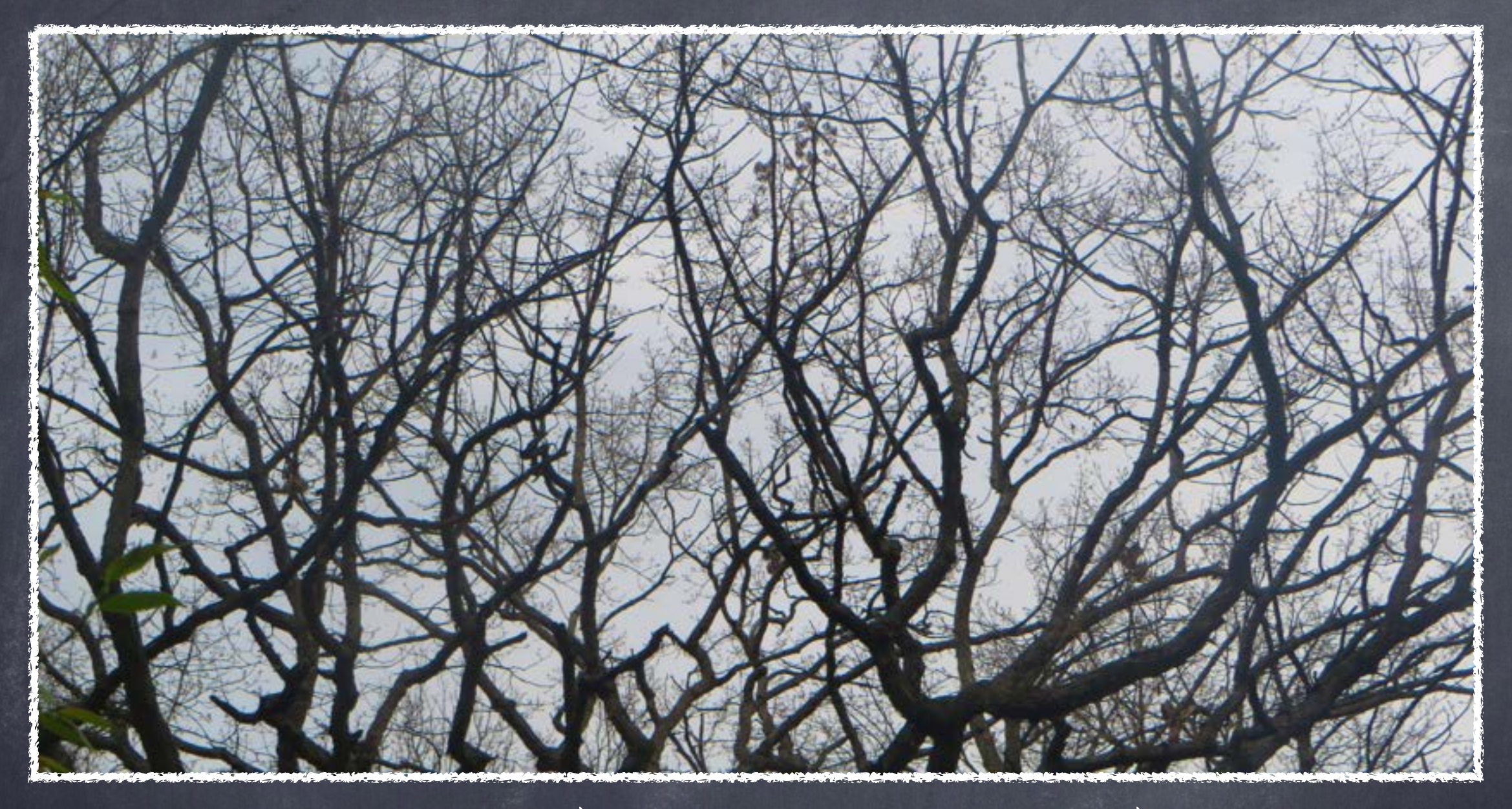
I liked the big oak tree because it is older than me.