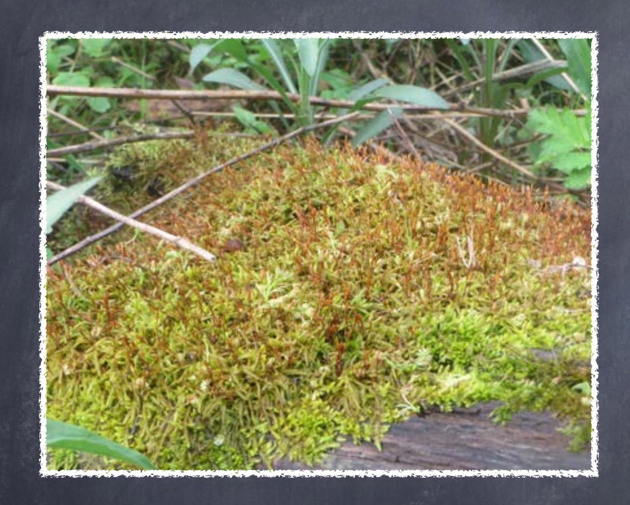
The moss I touched was like a soft blanket.