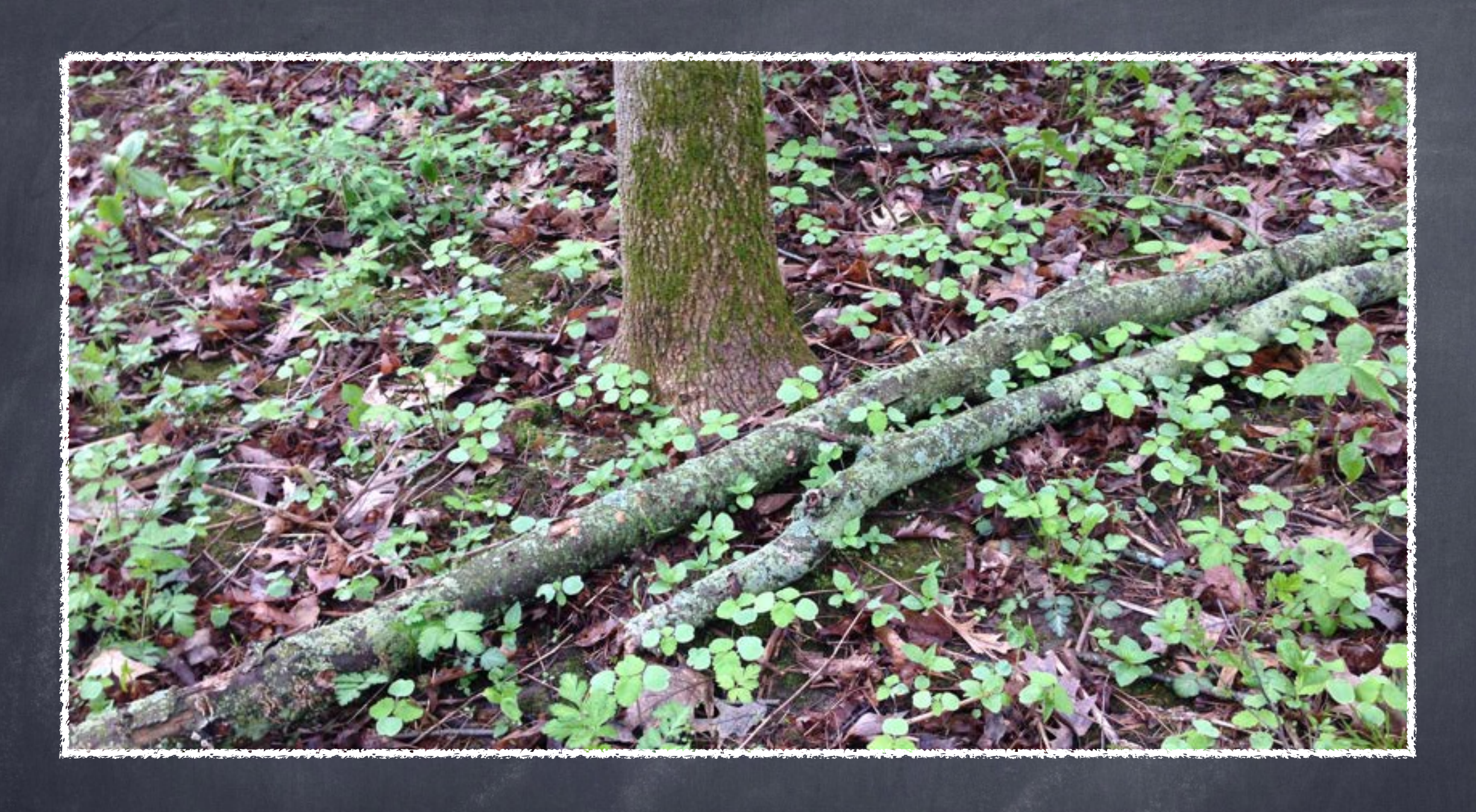
It had rained and the forest was magic and quiet.