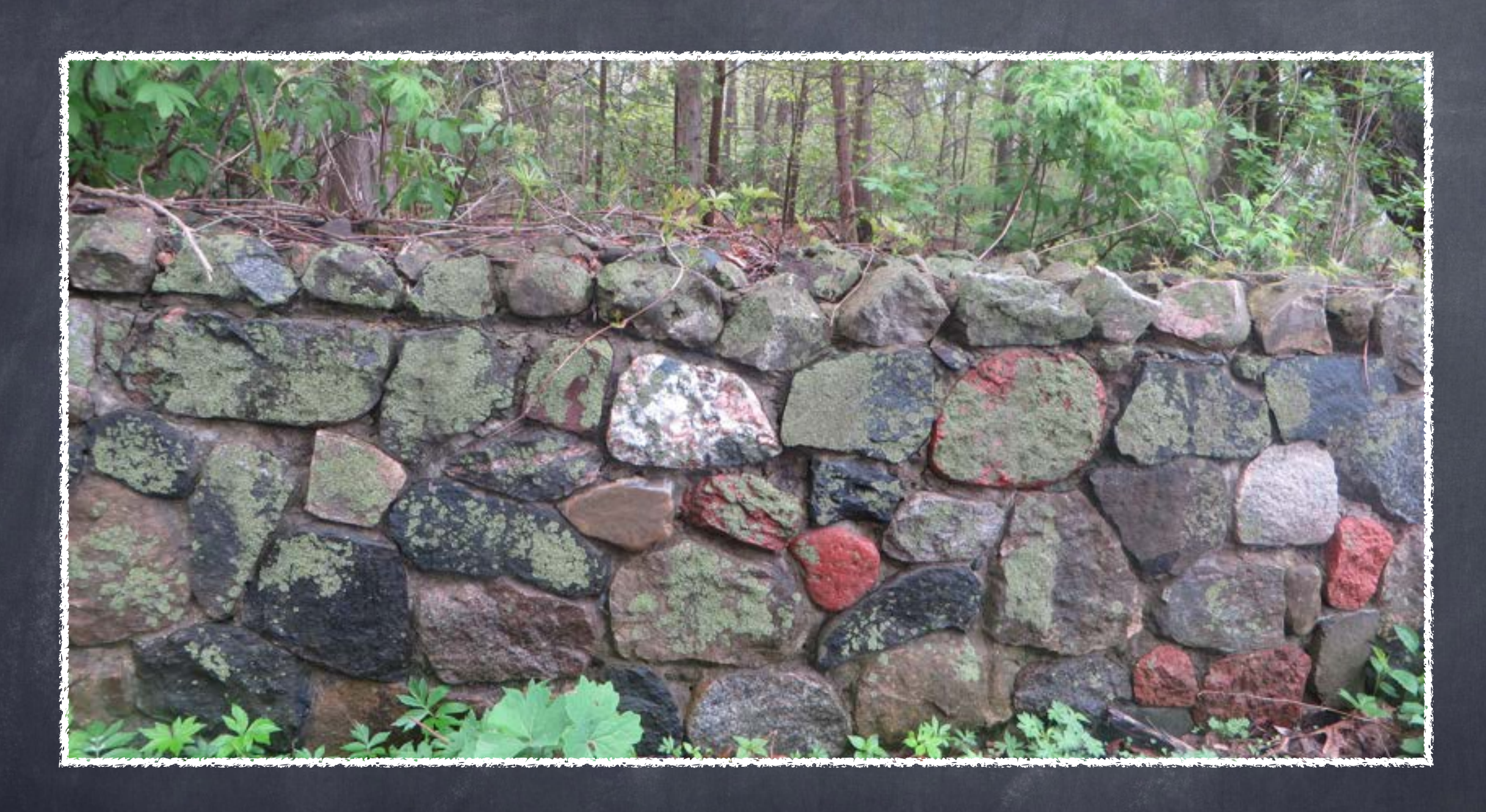
Lichens on the Stone Wall