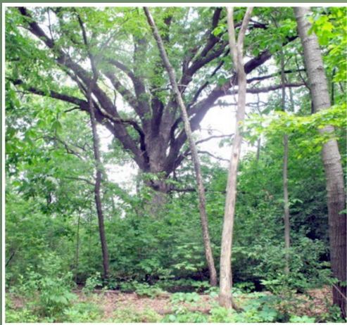
Bill's Woods Heritage Oak "BEFORE"

We need your funding to CONNECT volunteer labor with professional contractor work and remove undesirable shrubs and trees under the oak and throughout the woodland. We need your funding to CONNECT volunteer hours to seeds and plants for a new, native groundcover under the Heritage Oak.