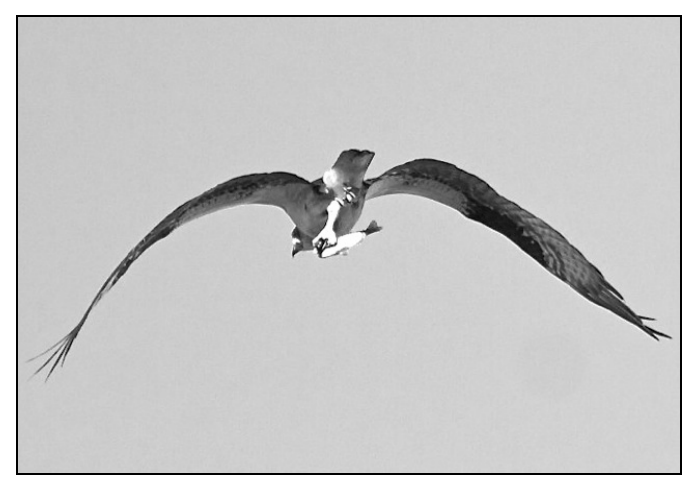
Osprey Carrying Fish, Summer 2010 (A Koziol)

In the last couple of years an Osprey has been seen breaking off sticks on Picnic Point in the spring, indicating an interest in nesting in the area. Osprey pairs nest on a high perch near water, often on manmade objects like cell towers. When will the Preserve host an Osprey pair and where will they nest? Watch