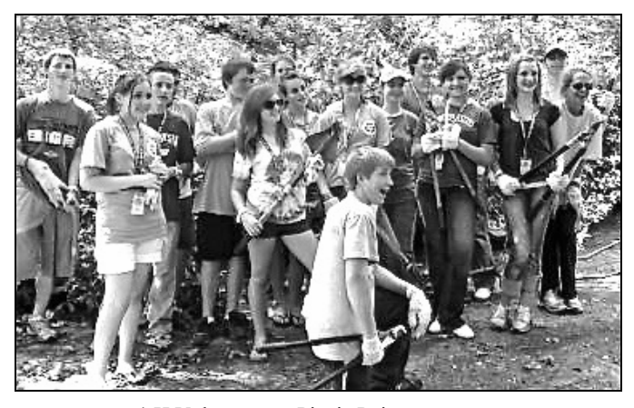
4-H Volunteers at Picnic Point

Preserve staff, interns, and volunteers have been working in the Picnic Point entrance area to remove undesirable woody shrubs and trees—mostly Buckthorn and Japanese Tree Lilac as well as some Eurasian Honeysuckle. The goals for the removals are to increase light reaching the ground in order to promote groundlayer plant growth and prevent erosion, to open up an area that has been recently used by people camping/living in the Preserve, and to allow staff to find and control other invasive species in this area including Porcelain Berry, Burning Bush, and Garlic Mustard. This area will continue to need care. Recent volunteer groups include 4-H, Americorps, Sullivan Hall Substance Free House, and the GreenHouse Residential Community.