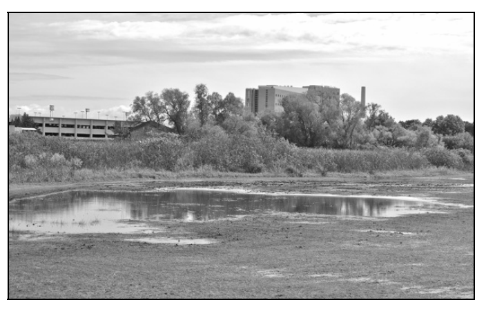
Flooded Area Behind Class of 1918 Marsh, 2010 (G Denniston)

As a result of the wet year, the lake was high most of the summer. The Class of 1918 Marsh remained high, flooding the playing fields and the path behind the Marsh. These flooded fields interfered with the use of the playing fields and killed some grass. The flooded areas also provided food and habitat for migrating shorebirds, including Pectoral Sandpiper, Greater Yellowlegs and Semipalmated Plover. The Sandhill Crane family with a colt could be seen feeding in the flooded ditches along the playing field to the edge of Shorewood Hills.